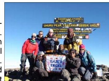
The highest point in Africa

We spend the final two days of our expedition on safari. The East African plains are unrivaled for their big game and huge roaming herds. Traveling in specially equipped vehicles and spending our evenings in quality lodges, we will see the best that Tanzania has to offer. We will visit Lake Manyara National Park, and the famed Ngorongoro Crater. We can expect to see zebras, lions, rhinos, hippos, cheetahs, and countless more, all wild on the plains. A trip to Kilimanjaro would not be complete without exploring these parks.